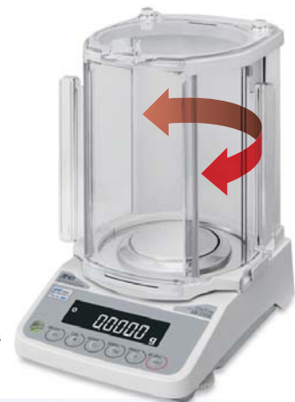
Rotary Sliding Doors

The breeze break is easily removed using a unique clip system, allowing fast, simple cleaning and use in confined spaces like gloveboxes and controlled environment cabinets.