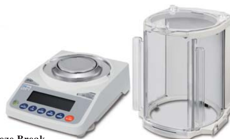
Removable Breeze Break

The breeze break is treated with an antistatic agent to ensure stable weighing. It also offers a large working space and can be detached for better portability and easy cleaning of the balance.